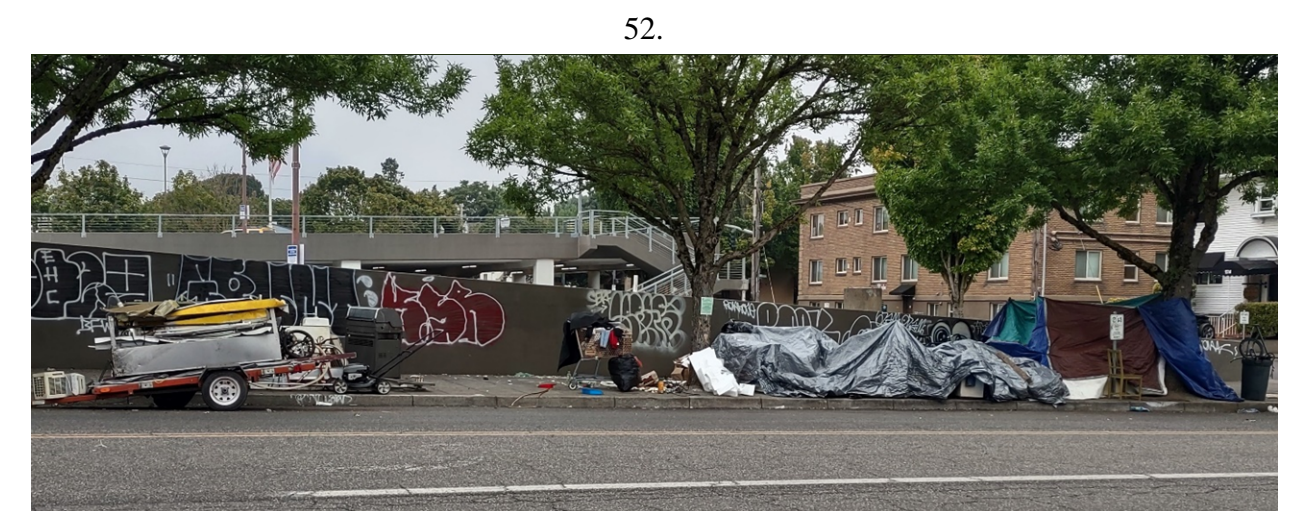
The tent encampment and garbage piles in this panoramic photograph completely blocks the sidewalk on the north side of NE Halsey Street near 14<sup>th</sup> Avenue in the Lloyd District. The tent encampments in Paragraphs 51 and 52 prevent persons with mobility disabilities from commuting to the numerous office buildings and jobs in the Lloyd District, as well as the many restaurants, shops, and amenities in the Lloyd District, including the Lloyd Center.