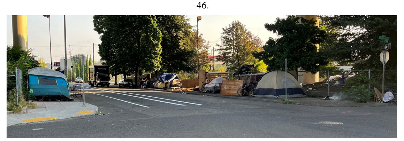
This panoramic photograph shows the extent of the tent encampments described Paragraphs 42 through 45. These tent encampments show that the sidewalks on both sides of NW 19<sup>th</sup> Avenue are blocked between Thurman and Savier Streets. This encampment is particularly problematic because it could prevent persons with mobility disabilities from crossing under I-405 without maneuvering unsafely in the streets.