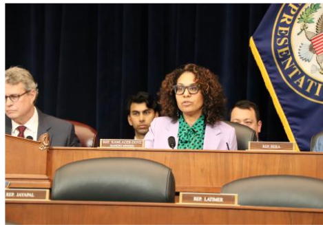
Watch the full video here.

Below are Ranking Member Kamlager-Dove's remarks, as prepared for delivery, at today's subcommittee hearing: